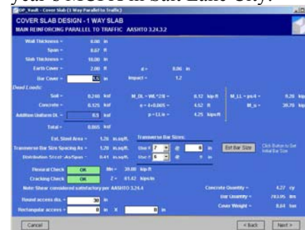
Screen shot at left from DP_Vault cover slab design